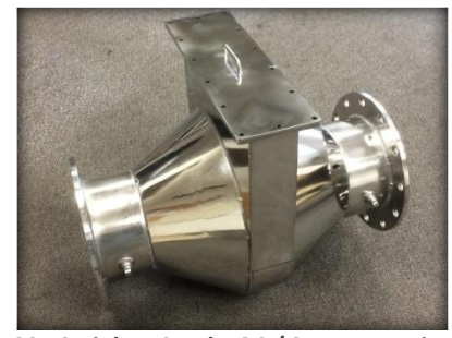
304 Stainless Steel DOC / 3-Way Housing