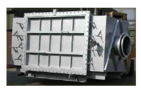
SCR Catalyst Housing